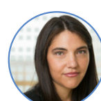
Dr Apolo Med Onc